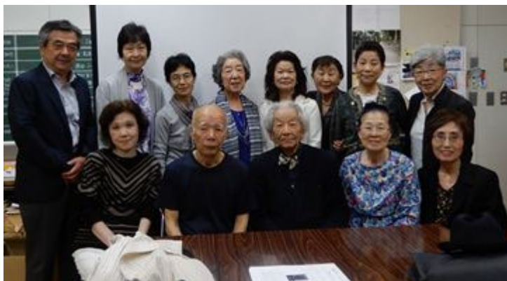
Commemorative photo taken after the Salon