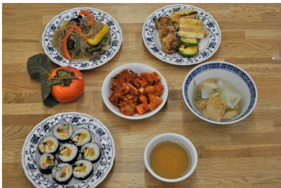
Clockwise from top left: ③, ④, ②, ⑤ & ①

A total of 24 attendees enjoyed the amicable atmosphere throughout the workshop. We could convince ourselves that we can override the reported national conflicts by learning the culture and cooking tradition of foreign countries under the UNESCO spirit.