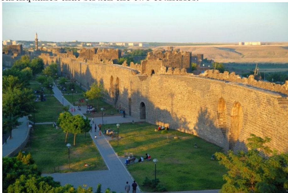
Diyarbakır Metropolitan Municipality

UNESCO on Monday expressed its support for Syria and Türkiye following the devastating earthquakes that struck the two countries.