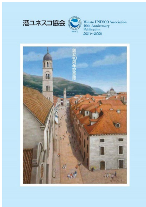
The MUA 40 th Anniversary Booklet

The commemorative booklet was distributed to all the attendees present. For MUA members who were absent, and for those who contributed their articles to the booklet, a copy will be mailed out from MUA's secretariat office.